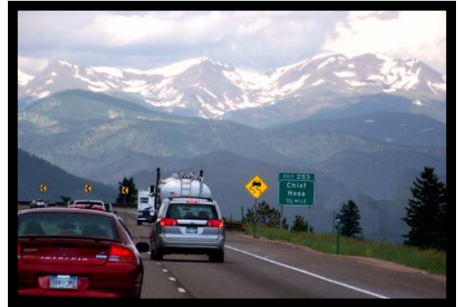
Our drive into the surrounding mountains

This sojourn proved that even though this new form of transportation is nowhere near as speedy or efficient as my previous aircraft, it does offer me the opportunity to occasionally use it for travel above and beyond the short, local “low and slow” flights to which I have become accustomed. While my previous Twin would have taken me from “here to there” in half the time as my current single engine “home built”, driving that same trip by car would have doubled the time required via my experimental airplane... and wouldn’t have been even half the fun.