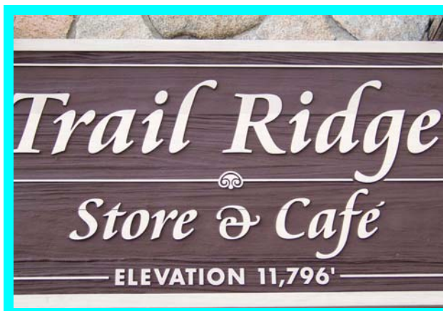
We eventually reached the roads summit