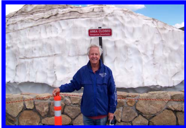
There was still plenty of snow left here