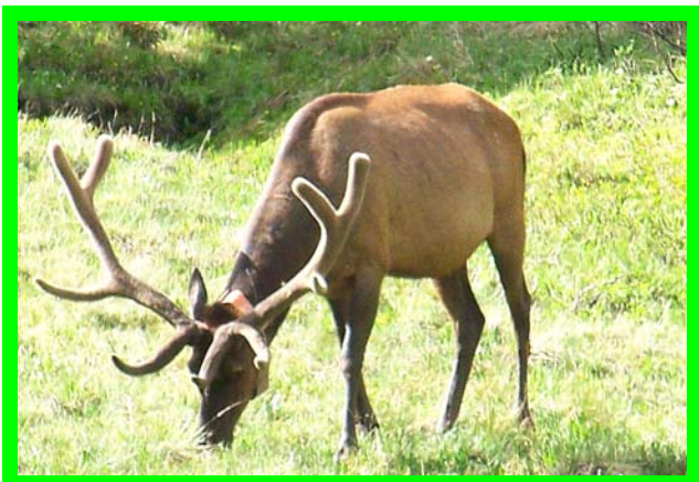
A majestic Elk, just some of the wildlife seen