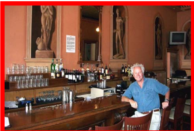
The historic Teller House bar in Central City