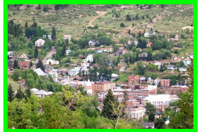
Central City, a typical Colorado mining town