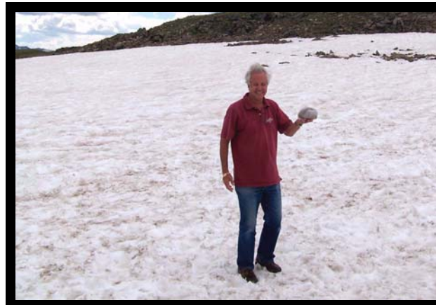
Me on a "snow field", with a snowball