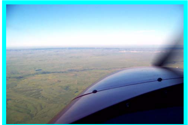
View from the pilots seat enroute to Denver

Central City, Colorado is one of those towns which made its mark, mainly due to the abundance of gold located under its mountains. However, today it is better known for taking that "gold" away from its visitors, as it is one of the "sanctioned" casino towns in Colorado. It has at least a dozen of those "gambling halls" and we had a chance to visit one of them, The Century. We were not so much interested in "striking it rich" ourselves as much as to partake in their advertised $5.99 prime rib dinner (which I may add was delicious and hearty). Central City still has standing its original 1890 Opera House, which even today sees a number of performances with known operatic singers. In fact the very day that we were there a performance of Puccini's Madam Butterfly was scheduled. We did not attend, but I did pose for a photo in front of that old, historic building.