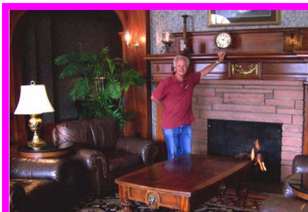
The Stanley's beautiful lobby and fireplace