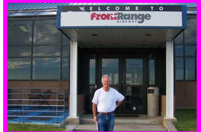
Arrival at Denver's Front Range Airport