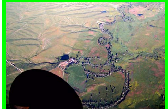
At 10,000 feet looking down (wheel at left)