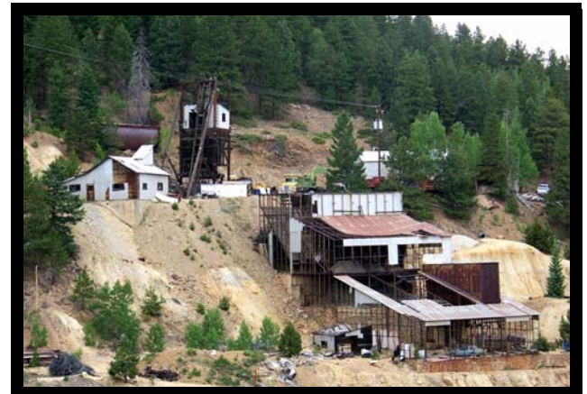
Working mountain gold mines still abound