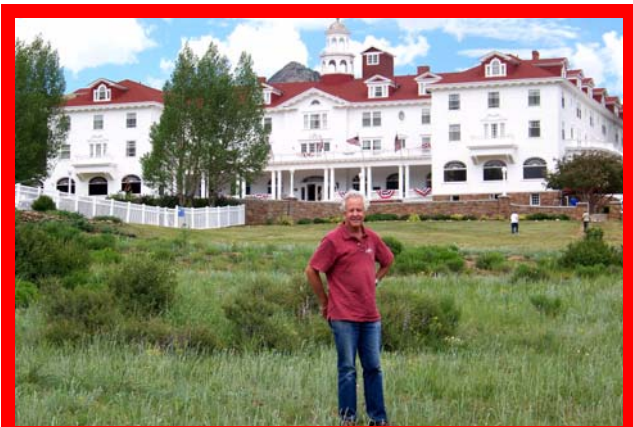
Estes Park's Stanley Hotel ("The Shining")