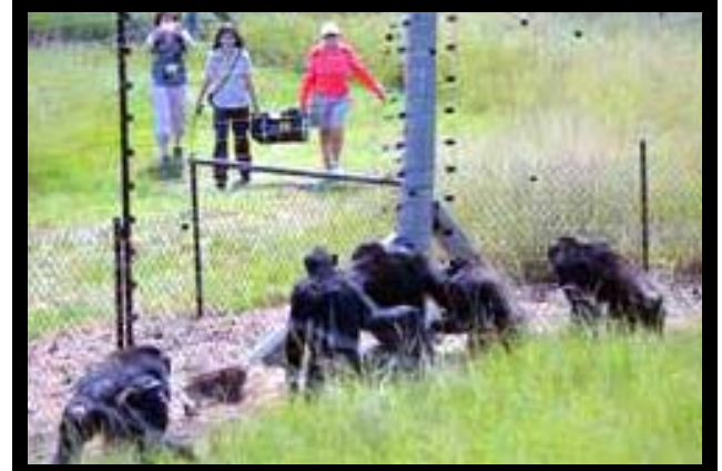
Foundation's web photo: The chimp's waiting lunch