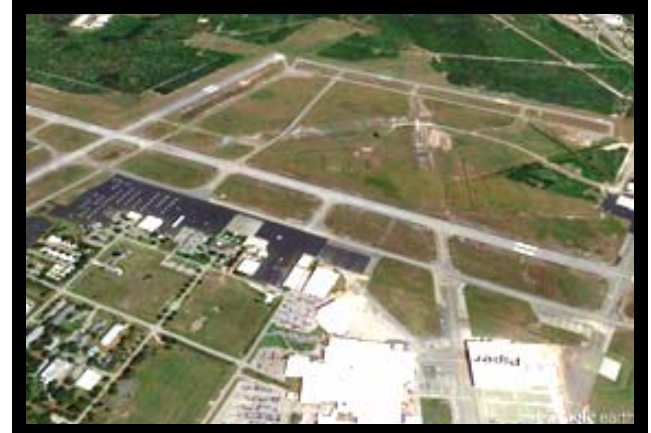
Downwind leg, over the Piper plant to Runway 29L