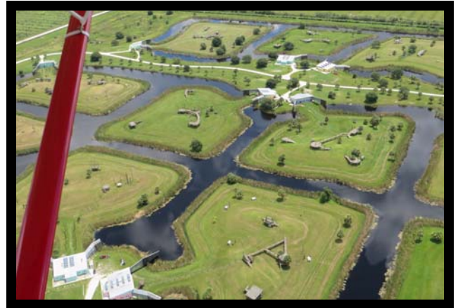
My overflight of the Chimpanzee Reserve complex

My left downwind approach to runway 29L, in fact, took me right over that Piper manufacturing plant. A short roll out brought me to taxiway turn-off D-3 and into the ramp area in front of the restaurant. After a short wait in their comfortable lounge area, replete with WWII memorabilia, I was ushered into their aviation decorated restaurant and given a window booth, which allowed me a view of both my parked airplane as well as the runway that I had just landed on. After a nice lunch I headed back out to the ramp, and my airplane, for the 30 minute return flight home.