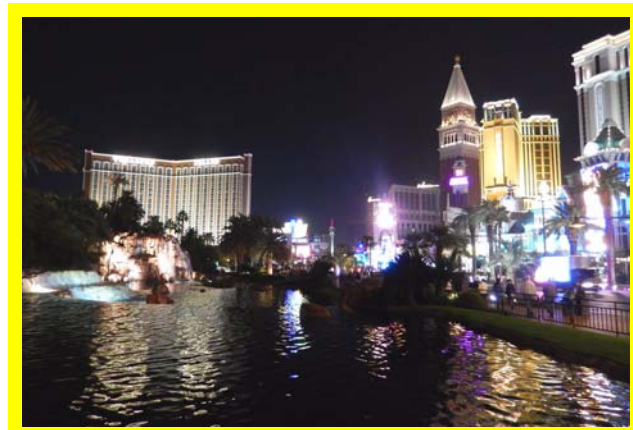
A night view in front of the Mirage Hotel's Lake