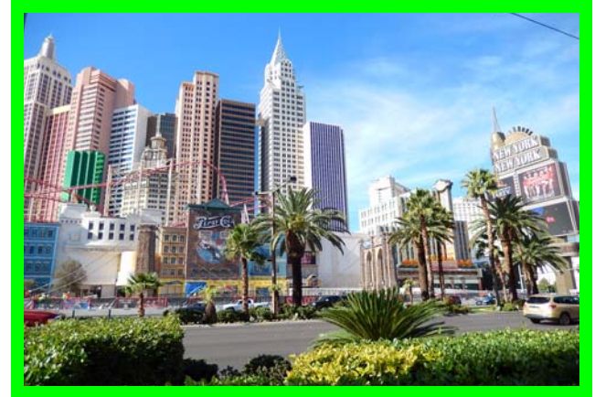
One of the downtown Casino Hotels, NY, NY