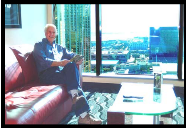
A view from the Hilton Hotel's 31st floor room