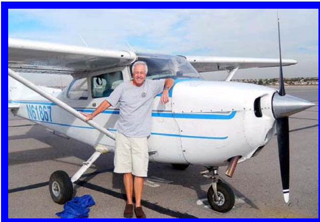
My rental Cessna 172 for this aerial adventure