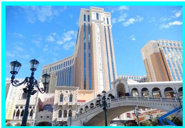
Venetian Hotel/Casino, as seen from the outside