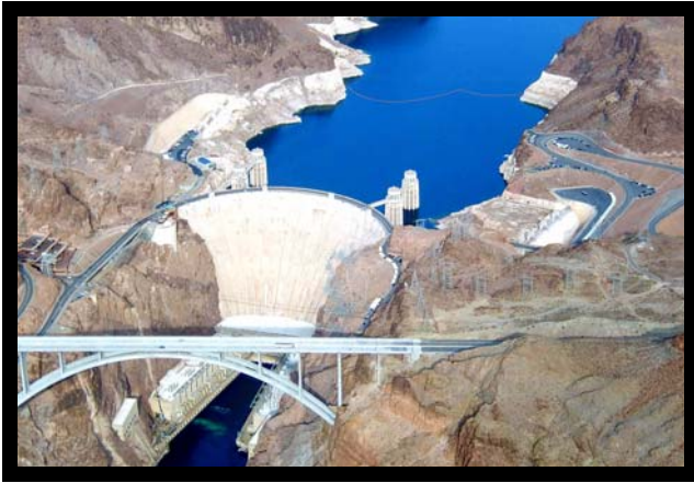
A view of Hoover (Boulder) dam from above