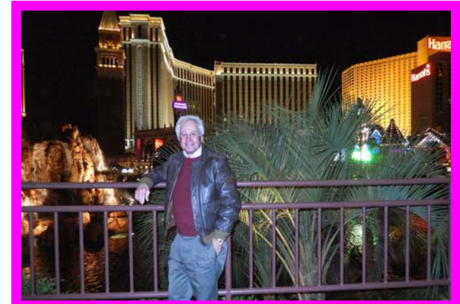
Me, waiting for the Mirage's Volcano to erupt