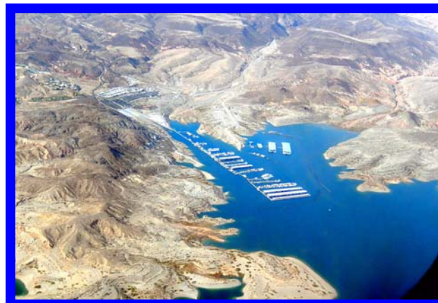
One of the several marinas that dot Lake Mead