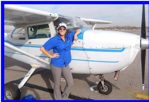
My safety pilot/instructor- will work for "hours"