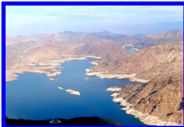
Lake Mead with its surrounding mountains