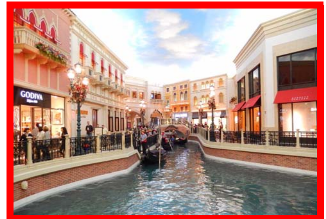
Inside view of the Venetian Hotel's Grand Canal