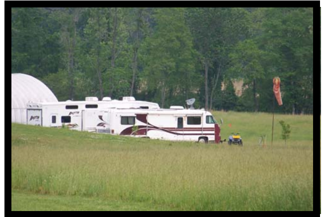
My campground for the event, next to the runway