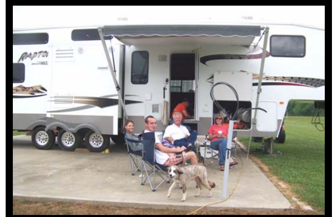
Saturday morning "breakfast with the neighbors"