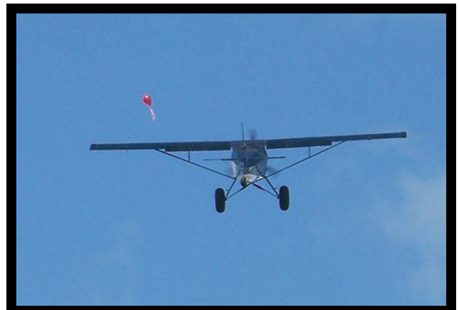
Now just where is that pesky balloon?