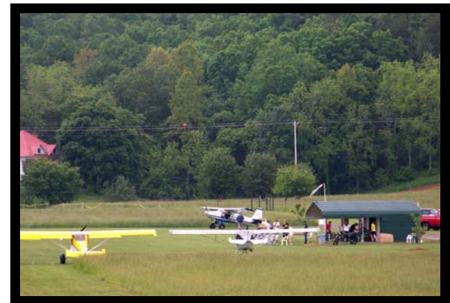
Planes gathering at the pavilion meeting place