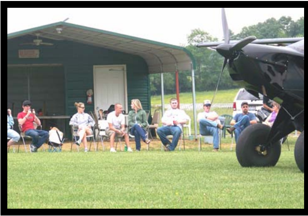
A tough crowd of “judges” watching the events