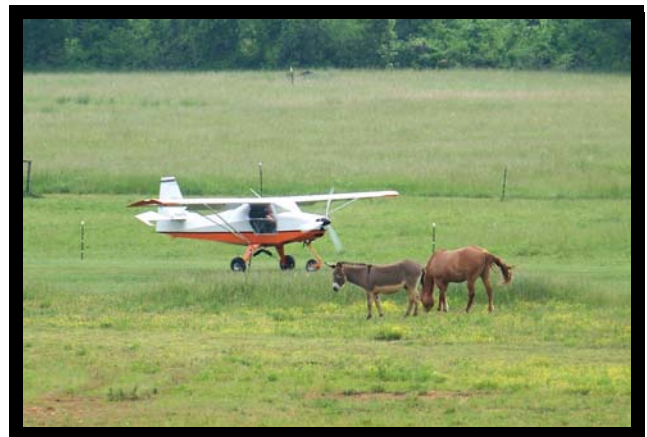
The airfield was shared with other creatures