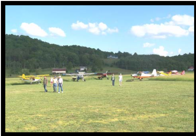
7 Just Aircraft planes participated on Saturday