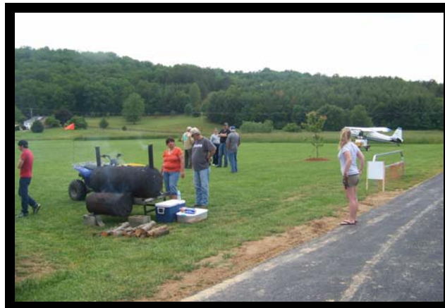
Getting ready for our evening’s barbecue meal