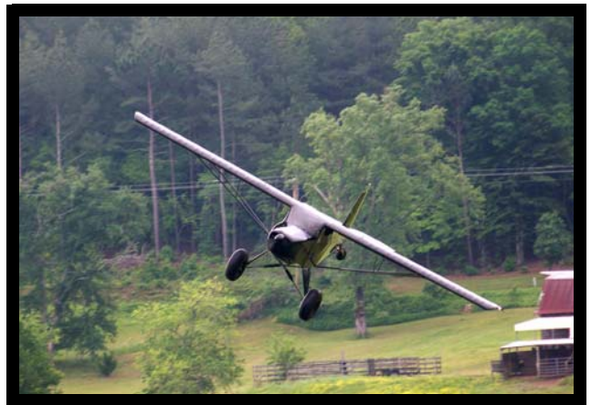
A Highlander demonstrating landing skills