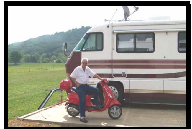
Getting ready for my ride over to the pavilion