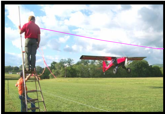
Flying in under the “Limbo” line set at 9 feet