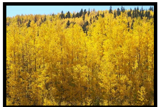
Aspen trees were showing brilliant yellow color