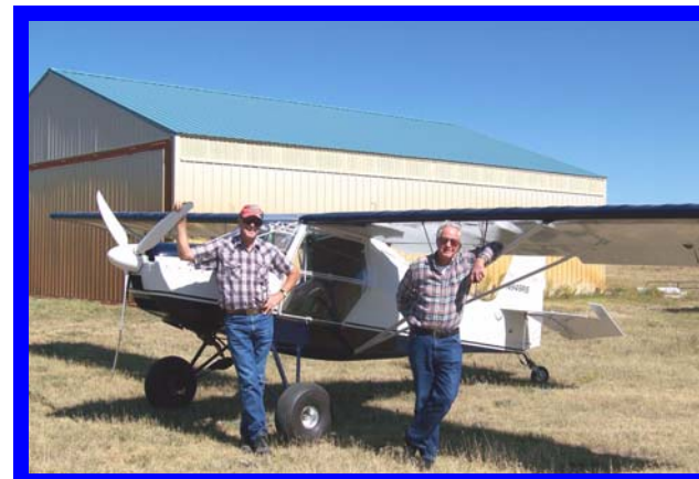
Roger Stout's home built Highlander aircraft