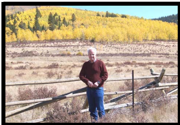
I was there during the peak fall color season