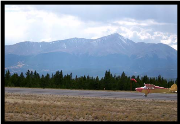
Leadville's runway and adjoining 14 K Mtn. peaks