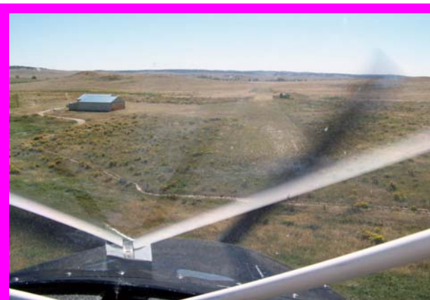
On final to Bottom Bayou airport's grass strip