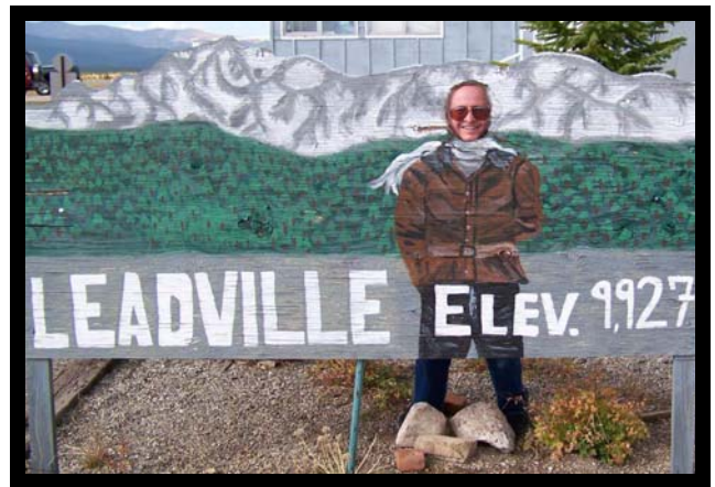
Me with my head thru the airport sign's cut-out