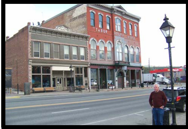
The "Baby Doe" Opera house on Main St.