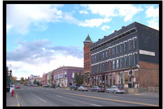
This is a view of Leadville's historic downtown