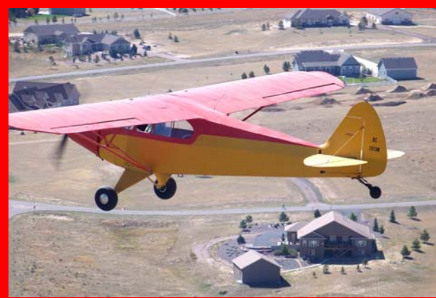
A "flying buddy" on one of our "day trips"