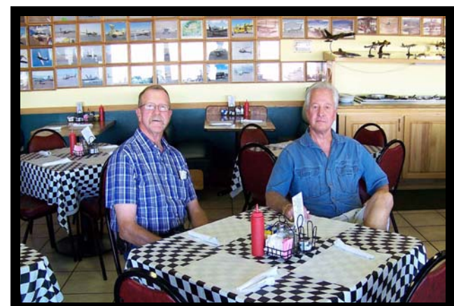
One of our "$100 hamburger" airport fly-in meals