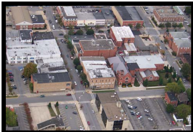
Elkins is a typical old, small & compact WV city