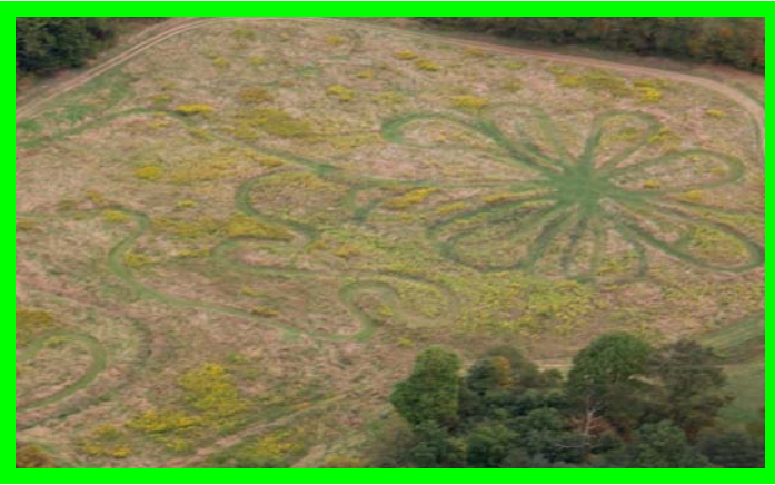
Flying over Mark's Sunflower Maze @ the campground