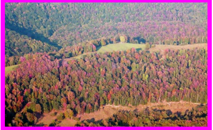
Color has already come to the higher elevations...