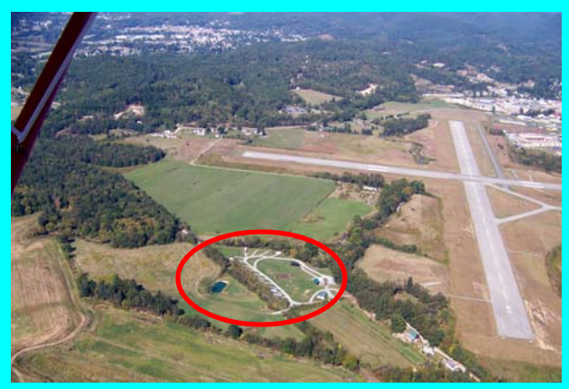
Elkins Airport w/ my campground circled in red