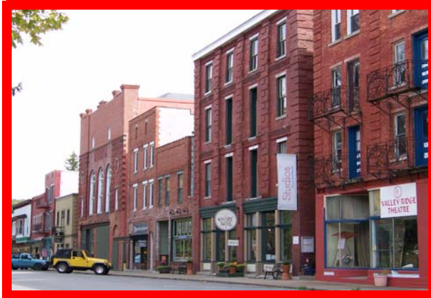
There is a lot of charm in these old WV towns