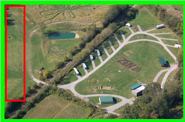
A close-up of the Pegasus Farm campground with its adjacent "runway" shown in red.