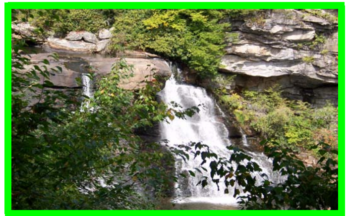
The Blackwater River water falls at the State Park