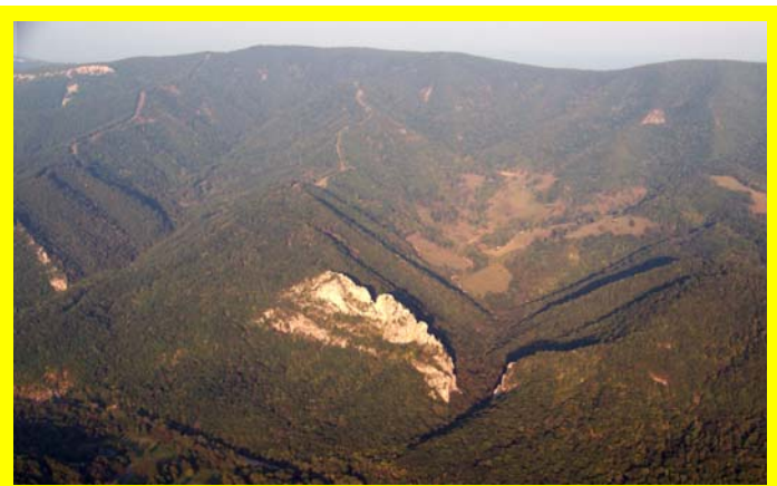
Seneca Rock & the mountains from 2,000 feet above...