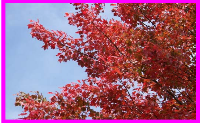
...and the leaves are equally beautiful from close-up