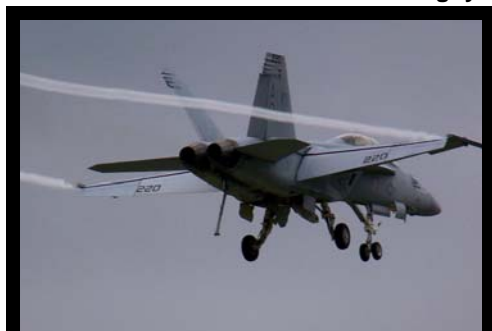
F-18A Super Hornet flying slow