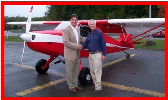
Me with my "new friend", the Governor of West Virginia