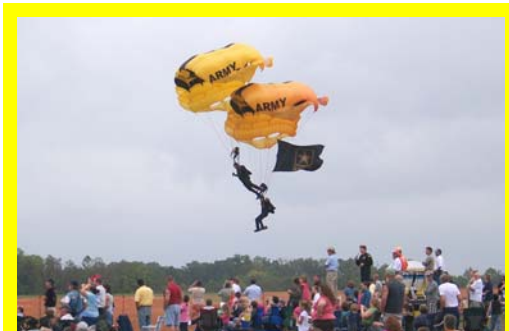
Army Golden Knights Parachute Team