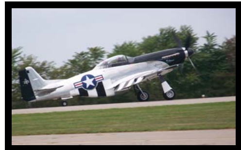
WW-2 P-51 Mustang landing