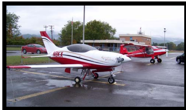
When I got to Elkins airport this small, sleek homebuilt was parked next to me. It looks really FAST!!

PS- I never did find out the name of that small sleek 2 place retractable home built. If anyone knows, please e-mail me at: HighlanderFlyer@aol.com