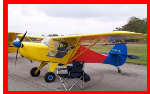
Adved Flyer homebuilt 2 seater