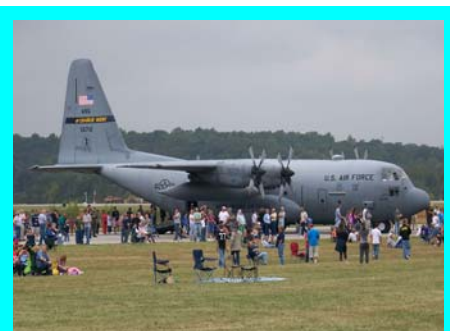
Hercules C-130 cargo/troop carrier