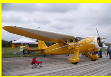
1949 Stinson Reliant monoplane